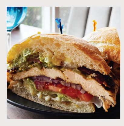
Crumbs Grilled Crab Sandwich 24.5 House-made wild-caught Canadian crab salad, served with Swiss cheese

Chicken Guacamole 16.75 Blackened chicken breast, bacon, fresh guacamole, Jack cheese, roasted chili peppers, onions, tomatoes & lettuce on a Ciabatta roll.